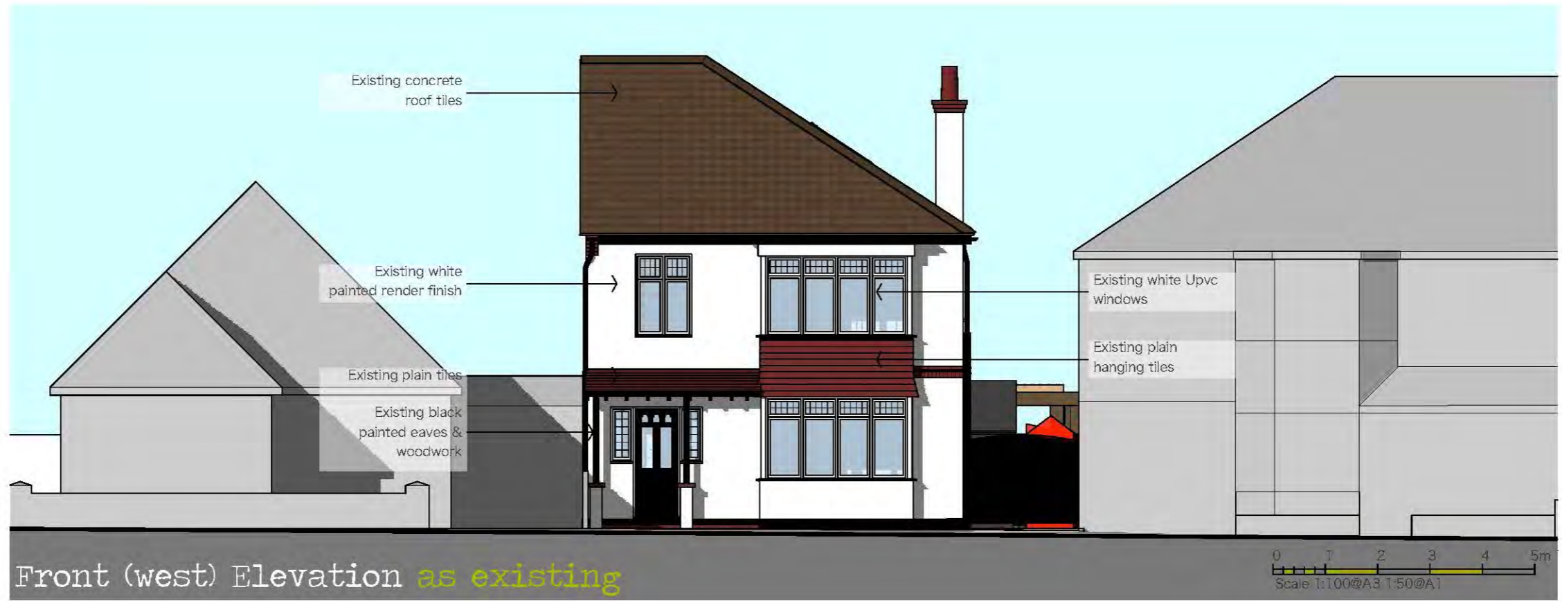
Front (west) Elevation as existing